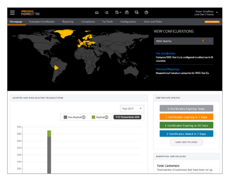
Thomson Reuters Indirect Tax Determination